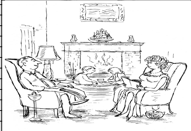
"I like this place. It has atmosphere."

To the Treasurer or Contact Person of a Group—if you receive a Birthday envelope with the Thank You letter that we sent you—you can use it for yourself or hand it out to someone celebrating an Anniversary or use it to celebrate someone's Anniversary-Anonymously.