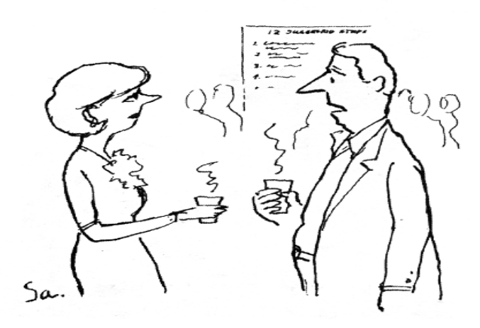
"Whenever I have a problem, I ask myself 'How would a grown-up handle it?"

A futurist who drank his way from the Thinktank to the Drunk-tank still keeps an eye on 2023. Picking up a bunch of grapes recently he marveled, "Ah, wine capsules!"