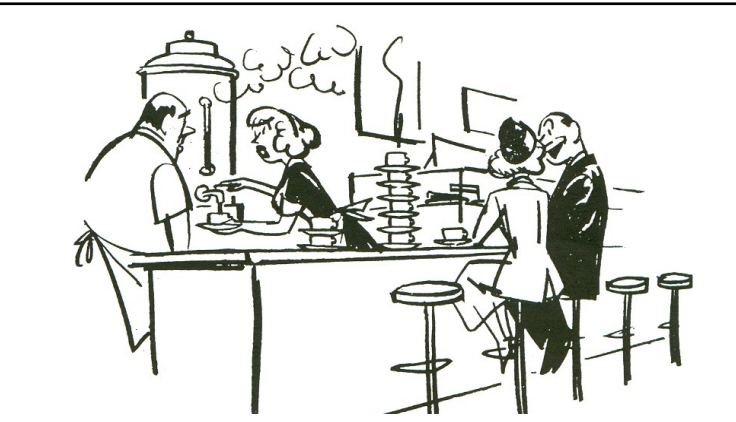
"I told them it was closing time and they as me to set'em up six cups of coffee apiece!"

That's 372 Years of Sobriety! Someone is definitely doing something right !Search out these people and find out their secret. ©