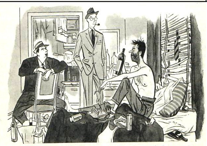
"Of course, you're the only one who can say whether or not you're an alcoholic."

And there was the little boy who became pretty well-versed in AA methods after his old man dried out. The kid greeted his father one night with "I want to show you my report card, but before I do, would you care to join me in the Serenity Prayer?"