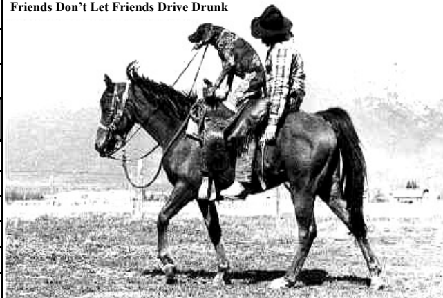
Friends Don't Let Friends Drive Drunk