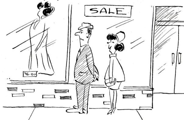
The First Ninety Days

“Let’s spend some of that booze money, now that you’re sober!”